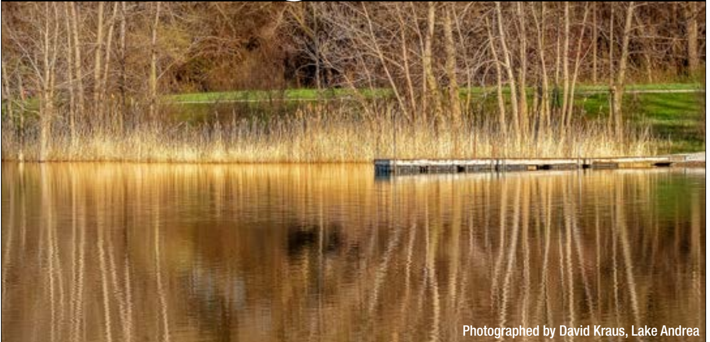
Lake Andrea